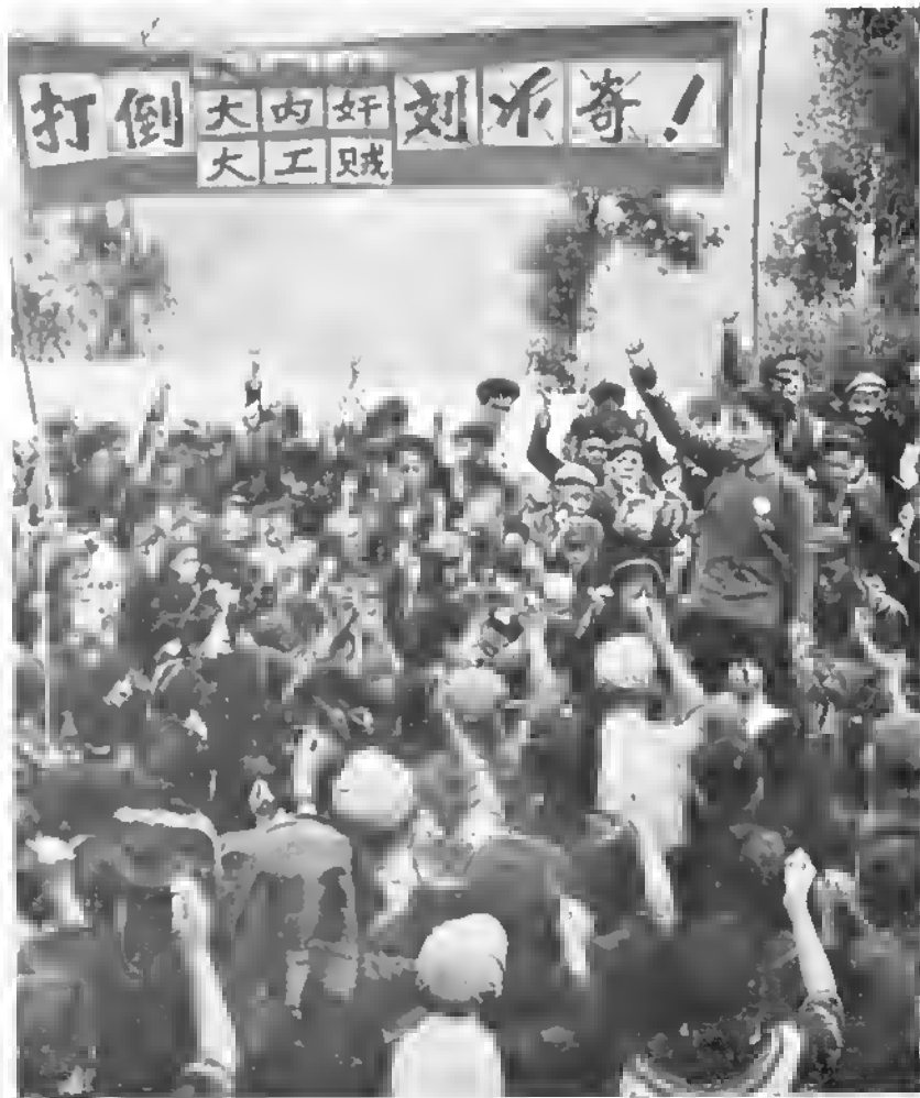
Kutsung people scathingly repudiate Liu Shao-chi for his counter-revolutionary revisionist line which drove them back into the jungle.

Today the Kutsungs are working alongside their brother Tai and Hani peoples in the Ninth Congress spirit of unity and victory to strengthen and develop their collective economy and match the rapid pace of the entire 700 million people of socialist China.